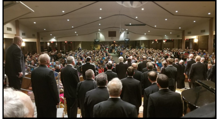
"Silent Night" at Velda Rose United Methodist Church

Ticket prices for Holidays with Orpheus are $25 for adults, $20 for seniors and students and $10 for