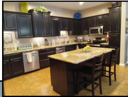
Kitchen and living room in Children's Cottage for 10.