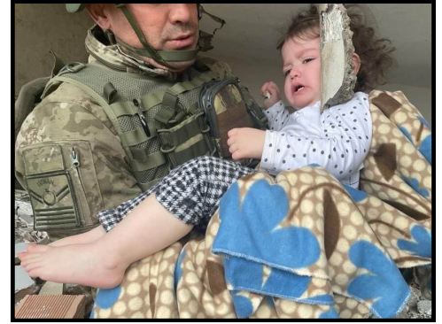
A little girl is rescued in Gaziantep, Turkey after a series of earthquakes hit Turkey and Syria on Monday, Feb. 6, 2023.