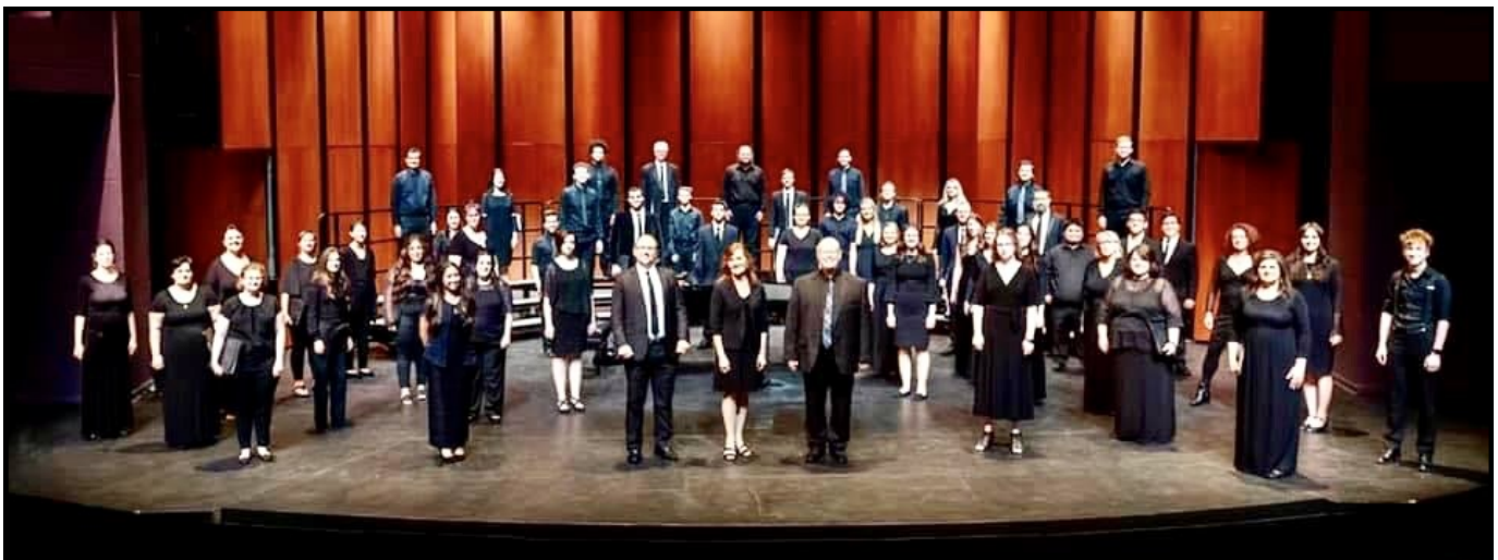
The Chandler-Gilbert Community Choirs

Thank you for your support of our concert series. We look forward to our next season which will begin in the fall. We are in the process of scheduling organists, soloists and a musical production at Christmastime.